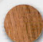
Honey Oak* (interior only/ white exterior)