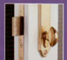
A solid brass center deadbolt and keyed lock provide maximum protection.