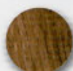
Amber Oak* (interior only/ white or tan exterior)