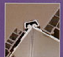
The continuous fixed geared hinge has been certified to be fully functional after 1.5 million opening and closing cycles.**