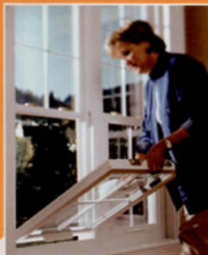
Double Hung windows tilt in for easy cleaning, while Slider windows feature a lift-out sash panel to help with window maintenance.

Warranty Simonton Impressions® windows and doors are backed by a comprehensive Lifetime Limited Warranty that covers the vinyl, hardware, screens and glass units. Including accidental glass breakage.