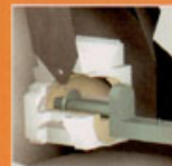
Donny Clip™ Pivot System