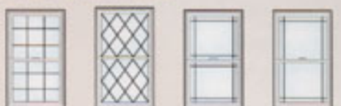
Colonial Diamond Prairie Perimeter