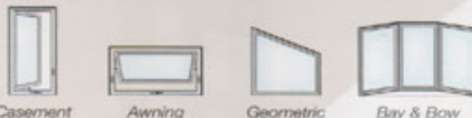
Casement Awning Geometric Bay & Bow