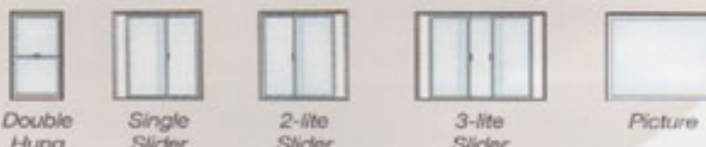
Double Hung Single Slider 2-lite Slider 3-lite Slider Picture