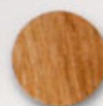
Honey Oak (interior only/ white exterior)