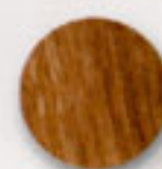
Amber Oak (interior only/ white or tan exterior)