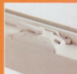
Color-matched Carn Lock