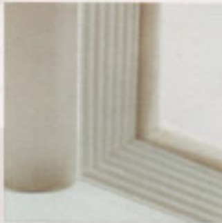
The Terrained Super Spacer® is made of solid silicone foam and reduces conduction rates to all-time lows.

Making the best even better. The standard Low E/Argon-filled glass package can be upgraded to provide even more energy efficiency.