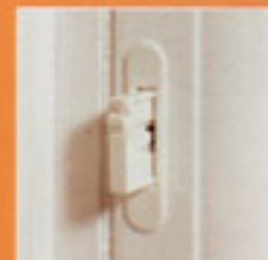
Dual Air Loks™